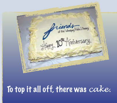
To top it all off, there was cake .